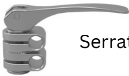
Serrated Slide-on Joint