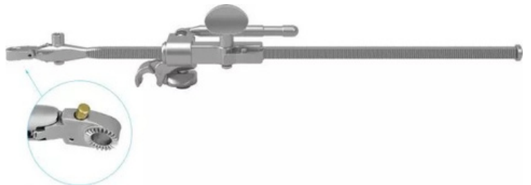
Micro-Adjustable Quick Angle 10"