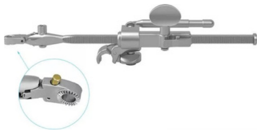
Clip-On Quick Angle 8"