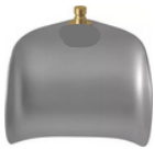
Balfour [with lips] 82mm x 72mm (3 ¼" x 3")