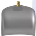
Balfour [small lips] 76mm x 72mm (3" x 3")