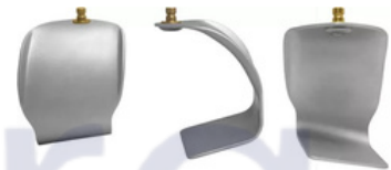
Non-Slip Balfour Right 80mm x 100mm (3" x 3 ¾")